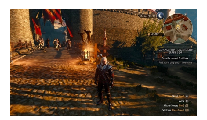
Figure 3: The 'Gate of the Hierarch' in Novigrad, showing the Fast Travel waypoint (behind Geralt) where the soundtrack vocals change (CD Projekt Red, 2019).

Geralt carries two swords, one silver, for monsters, and the other steel, for humans/humanoids. Two particular cues create contrast for the different combat styles: 'Silver for Monsters' and 'Steel for Humans...' (Przybyłowicz & Stroinski, 2015). These 'are heard in the provinces and kingdoms of the mainland and signify enemies through conflicting uses of the voice' (Smith, 2020, p. 158). As mentioned earlier, 'Silver for Monsters...' uses the voice to emulate monster attacks. On the other hand, 'Steel for Humans' 'uses the voice, instead of mostly vocalisations, to signify combat with humans ... the voice includes Bulgarian lyrics that portray the sentience of humans and their ability to discriminately attack Geralt' (Smith, 2020, p. 160). These different uses of the voice aid greatly in distinguishing different combat styles in the game. Furthermore, it is interesting to see how the various timbres of the voice can be used to represent a multitude of in-game events. The player, as they progress through the game, can perhaps rely on these locutions to predict in-game events - thus increasing their engagement. The Witcher 3 shows how versatile the female voice is as an element of RPG soundtracks: it is used to signify different types and styles of combat, to highlight environmental changes, and to highlight emotional depth within the construction of Geralt's masculinity.