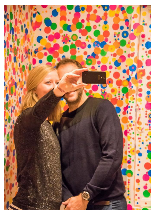
Figure 3 (openverse, n.d.-b): "Artwork by Yayoi Kusama" by Infomastern (2015). Reproduced under the conditions of a creative commons license CC BY-SA 2.0.-