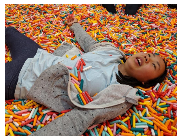
Figure 1 (openverse, n.d.-c): "Museum of Ice Cream, San Francisco" by mliu92 (2019). Reproduced under the conditions of a creative commons license CC BY-SA 2.0.-